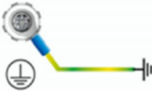
Figure 1: Socket-outlet protective earthing connection