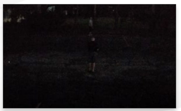
Color image without STELLAR at 0.02 Lux