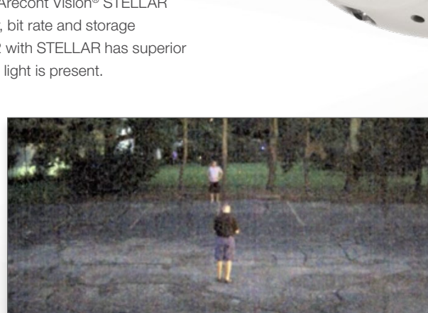
Color image with STELLAR at 0.02 Lux

MegaBall G2 features a 1.2MP model with Spatio Temporal Low Light Architecture (STELLAR) technology, which allows for color imaging in near complete darkness. Arecont Vision® STELLAR technology utilizes a patented algorithm that reduces noise, motion blur, bit rate and storage requirements. Along with adaptive contrast enhancement, MegaBall G2 with STELLAR has superior low light sensitivity, making it capable of covering areas where very little light is present.