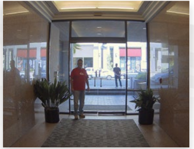
Megapixel image with WDR

Users can achieve clear images in extreme lighting conditions with MegaBall G2 WDR cameras in resolutions of 1080p and 3MP. Wide Dynamic Range up to 100dB at full resolution balances light and dark areas in the same scene, such as in the lobby of an office building with large windows, the loading dock at a distribution facility or many retail environments.