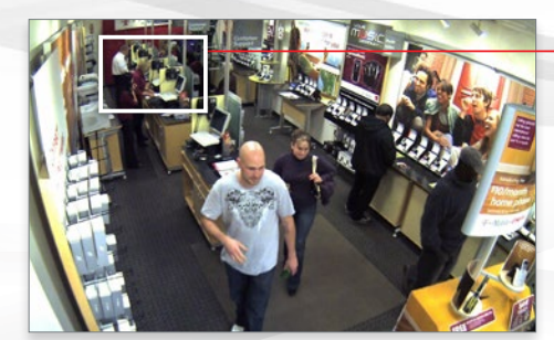
Wide Field of View