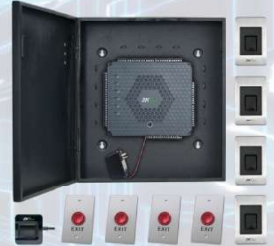
Atlas460-4 Door KIT