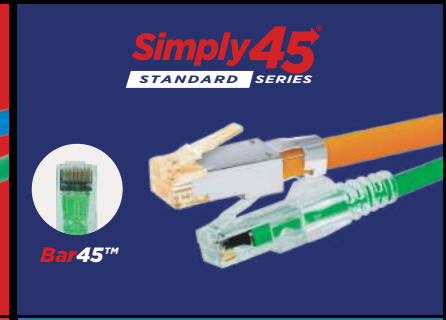
Simply45™ STANDARD SERIES