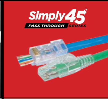
Simply45™ PASS THROUGH SERIES