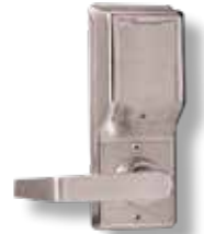
Secure battery compartment on inside door