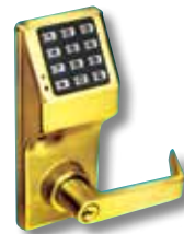
Lever set in US3 DL2700/3