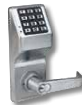
With IC Core in 26D DL2700IC/26D