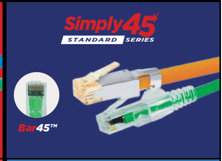
Simply45™ STANDARD SERIES

Simply Easier to Use Simply Better Quality Simply More Affordable YOUR CONNECTOR SOLUTION CENTER FOR CAT5E, CAT6, CAT6A, CAT7, AND CAT7A