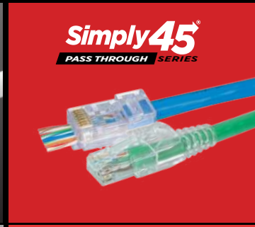
Simply45™ PASS THROUGH SERIES